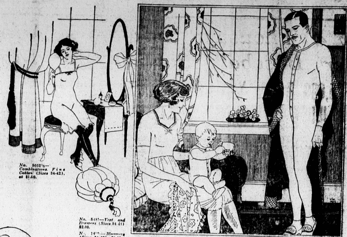
No. 5052 1/2—Combinations. Fine Cotton (Sizes 34-42), at $1.50. No. 4487—Vest and Drawers (Sizes 34-42) $2.00. No. 147—Hosiery (Sizes 34-42), $1.25. No. 1800—Infants' Vests, Silk and Wool (Sizes 1-6), 85c up. No. A. C.—Natural Combinations, medium weight, an excellent wearing garment made from carefully selected combed wools. (Sizes 34-42), at $4.00. Shirts and Drawers, $2.25 per garment.

STANFIELD'S Unshrinkable Underwear is made in sizes, weights and styles to suit every member of the family. Stanfield's fabrics are soft as down and soothing to the tenderest skin. Stanfield's garments are cut and tailored to fit perfectly, without binding or bulging.