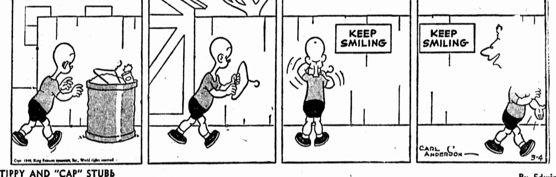
TIPPY AND "CAP" STUBB