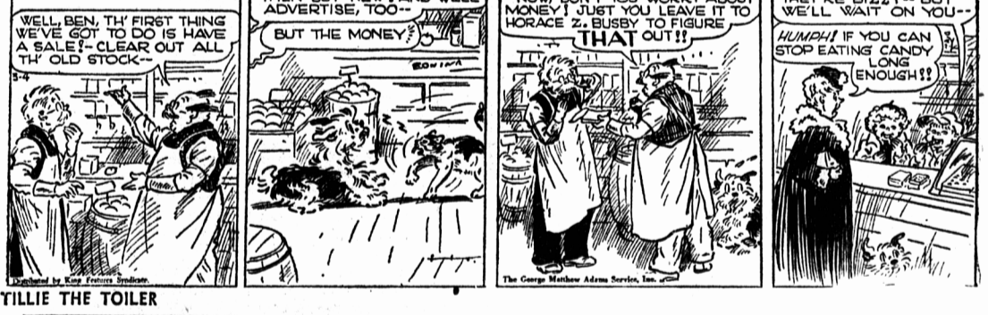
TILLIE THE TOILER