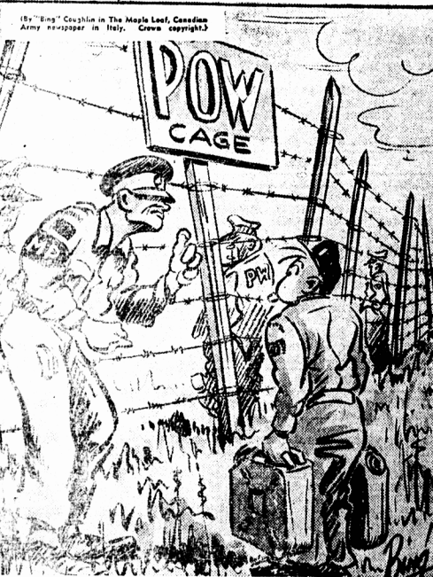
"No! POW does not stand for Petrol, Oil and Water!"