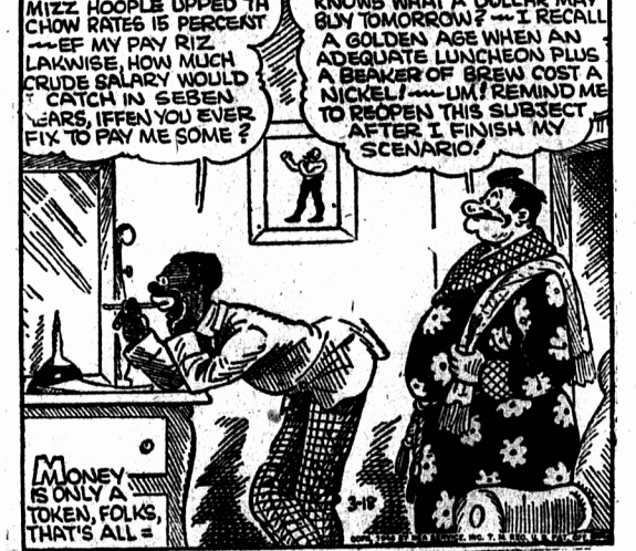
By HAM FISHER