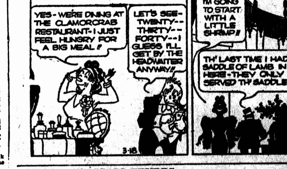
TIPPY AND "CAP" STUBBS