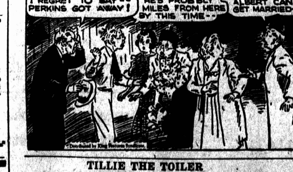
TILLIE THE TOILER