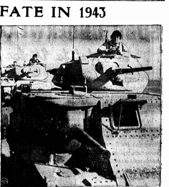
WHY'LL GET THE JUMP IN THE NEAR EAST? American "Gen. Grant" tanks like these flock into this vital theater — and Rommel admits they are good.

Already Rommel has met U. S. tanks which he admits are good. Some had American crews. So have the American planes which always improving in quality and numbers, fly across the South Atlantic and Africa. And tanks and planes are not all. Few Americans understand nearly the Near East is a major "second front" where an Allied offensive would directly support Russia and might reconquer the Balkans and eventually free Italy. In that Allied offensive, more than tanks, planes and their crews would be American. Suppose a favorable solution can be found for the three phases—then what? By some time next year we may have abroad 4,000,000 men—almost twice as many as in 1918. We can make the equipment for them if, as now seems likely, we put into effect the industrial mobilization plan worked out in peacetime by our Army but hitherto adopted only by the Nazis. It will last probably two years, but some not exactly feathered. The war will enter a new phase. Then Hitler will be fighting at least a two-front war with a one-front army and air force. That phrase will be the American phrase. It will last probably two years, but some not exactly feathered. The war will enter a new phase. Today they believe we are just getting our first glimpse of it—dim, but of the shape of things to come.