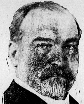
Sir Donald Mann