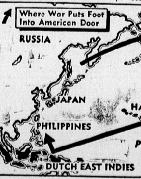
Map shows how spread of war to Dutch and Danish territories adds new menaces to the peace of America.

The war is on U. S. A's threshold. It puts its foot in the door at Greenland, form the Dutch Indies, East and West, it may walk in on us. Air power, which made those things even possible, may make them real. That is the picture we are facing today.