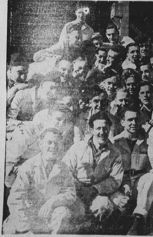
Every five months another 1,000 eager youths, ready to take their airplane motor tick, and what to do about it when it falters. They learn planes in the R.C.A.F. or in the aircraft industry, leave the aircraft all the multifarious jobs of maintenance, patching, welding, radio, school in Galt to start into on form or over his. In the five months hydraulics. When graduates enter the R.C.A.F., they fill out a they spend at the school, these youths work hard for their $9 a week, quest on fire, in which one question is whether the school's training of which they must spend $8 for board. They learn what makes an has been of real value. Every one on file to date reads "Yes."

What is the perfect Easter costume for a woman past 40? Specialists in clothes for the woman say it may be a suit, a coat or a jacket dress, but it must score high on the following 10 points. Silhouette: The older woman, thin or not thin, should insist on easy fit. A clinging silhouette accentuates figure faults.