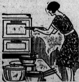
ALL THE KITCHEN UTENSILS