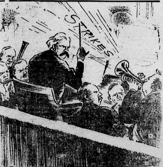
THE DISCORDANT NOTE Ramsay (conducting the orchestra): "You know, I'd be far happier if I could kick that fellow out altogether. He quite ruins the harmony!" —From London Opinion