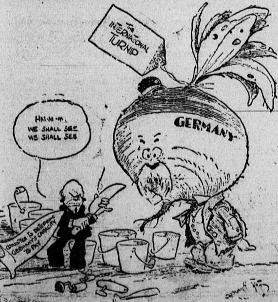
NOW JUST WHAT IS THIS THING STUFFED WITH? The investigating commission believes that Germany can pay reparations if she will. —From the Chattanooga News.