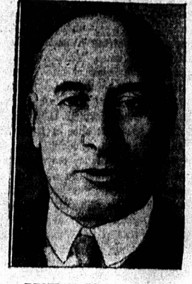
BRITISH COUNCILLOR Noted for his fine work during the war as Scottish director-general of aircraft production, Lord Weir will advise Great Britain's representatives at the Imperial Conference at Ottawa in July.