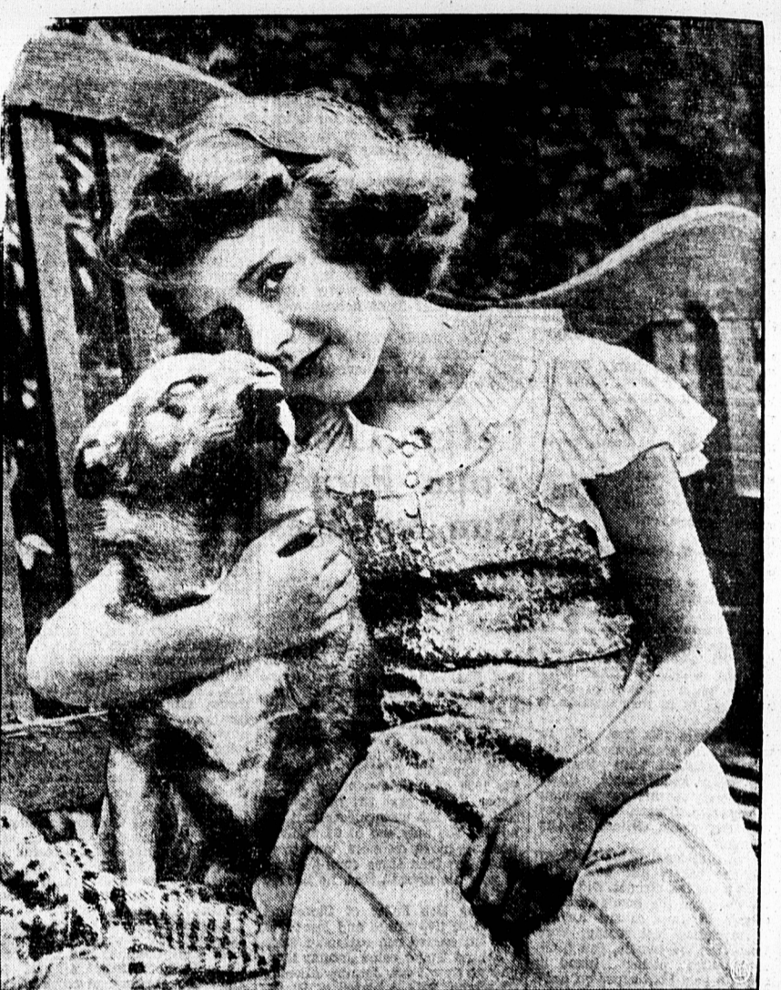
Closer moves the day when another Queen Elizabeth may rule Britain. With the Duke of York in the role of King, pretty, popular little Princess Elizabeth becomes the heir presumptive to the throne. Here she is shown in an exclusive, new portrait, fondling her pet dog—a child who already has captivated the hearts of millions of her future subjects.