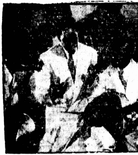
THE INK SPOTS