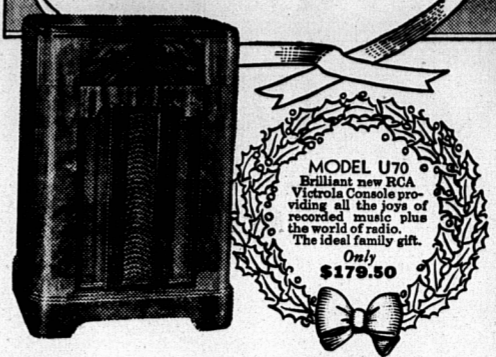
MODEL U70 Brilliant new RCA Victor Console providing all the joys of recorded music plus the world of radio. The ideal family gift. Only $179.50

This year give them the Gift that Keeps on Giving!