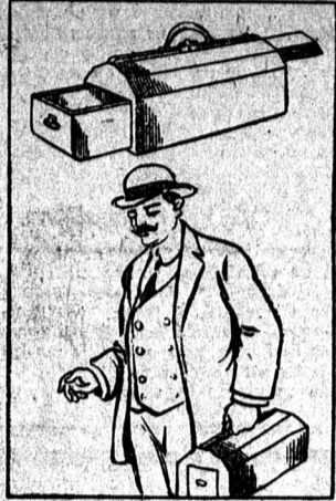
HANDY TO CARRY ICE-CREAM

An ingenious invention in the form of a portable refrigerating case is this longitudinal receptacle which has a drawer running its length. Above this drawer is another, smaller drawer, de- signed to contain cracked ice, prefer- ably sprinkled with rock salt. At the bottom of the box is a water reservoir.