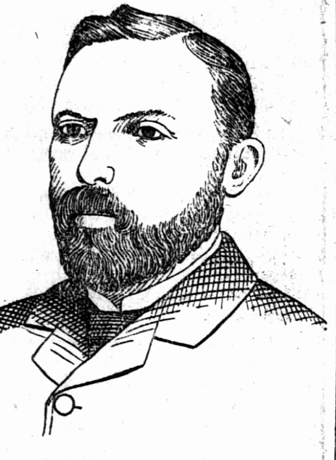
HIS HONOR, LT-GOV. MCINTYRE Who will open the Legislature this afternoon.

Gas supplied at a reduced figure for above purpose. May 5th. 1900: Sat, Tues, Thurs 1mo