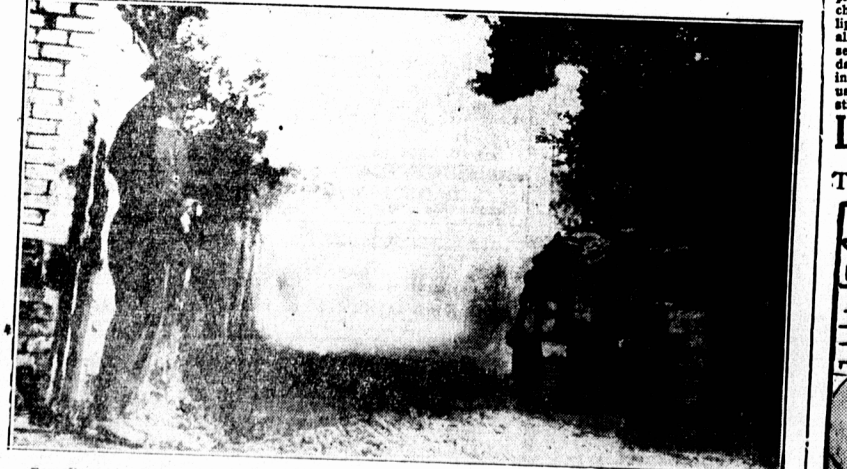
Canadians in heavy fighting. German mortar shells are here seen bursting on a road down which Canadian tanks and infantrymen advanced during bitter fighting for the villages and aerodrome at Carpiquet.

CIVILIZATION? LONDON — (CP) — The alert signal flashed on the screen in a suburban theatre. In the distance a flying bomb crashed and then another, a character in the movie said: "So, this is what they call civilization!"