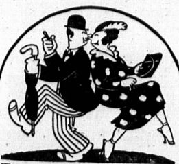
The Morning After Taking Carter's Little Liver Pills