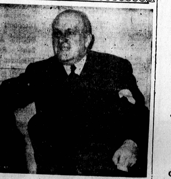
Sir Frederick Handley Page, C. B. E., one of Britain's outstanding aircraft designers and manufacturers, recently arrived in Montreal as head of the United Kingdom's delegation to PIAAO. He foresees safer flying from PIAAO talks.

ANNUAL MEETING P. E. I. POTATO GROWERS' ASSOCIATION Canadian Legion Hall 57 GRAFTON STREET—BELOW PRINCE EDWARD THEATRE Tuesday, March 25, 1947 2:30 P.M. and 7:30 P.M. The Annual Meeting of the P. E. I. Potato Growers' Association for the transaction of general business will be held in the Canadian Legion Hall. We invite anyone interested in the potato industry to attend. 7:30 P.M. EDUCATIONAL MEETING open to the public at which time various phases of the industry will be considered including marketing, grading, diseases, spraying and a discussion about making Prince Edward Island a disease free area for potatoes. It is in your interest to be present at both meetings. By Order of Directors, P. E. I. POTATO GROWERS' ASS'N.