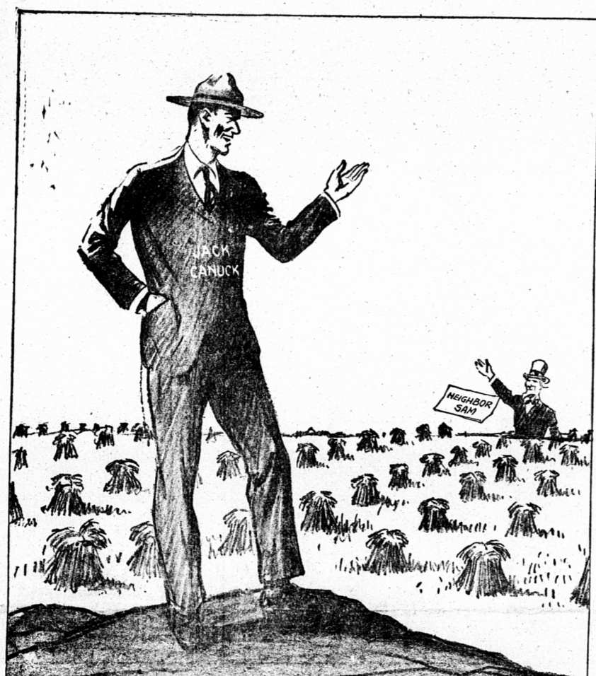
Now that the war clouds are rolling away Canada can give thanks for a bountiful harvest and the promise of better times.