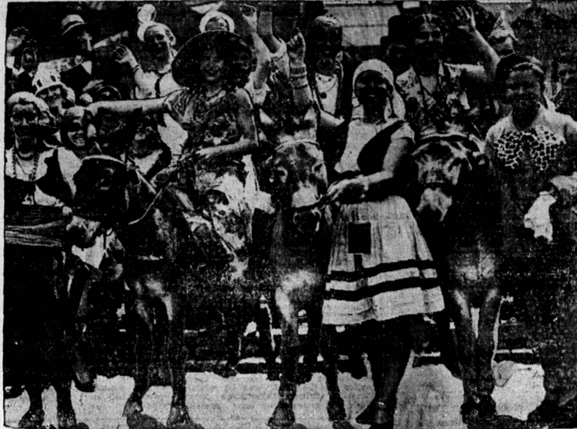
STRANGE COSTUMES AND HAIRY FACES MARK CELEBRATION

Hey, red cap! Just look after these for a while, eh? Messenger boys in England apparently have a larger scope of duties than on this side of the water.