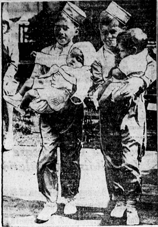
THESE BOYS CAN TAKE ON ANY JOB

Hey, red cap! Just look after these for a while, eh? Messenger boys in England apparently have a larger scope of duties than on this side of the water.