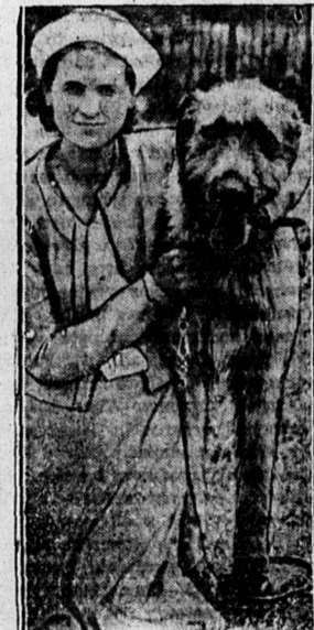
IN LADIES' HANDICAP