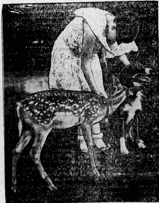
YOUNG DEER BEFRIENDS COLLIE DOG