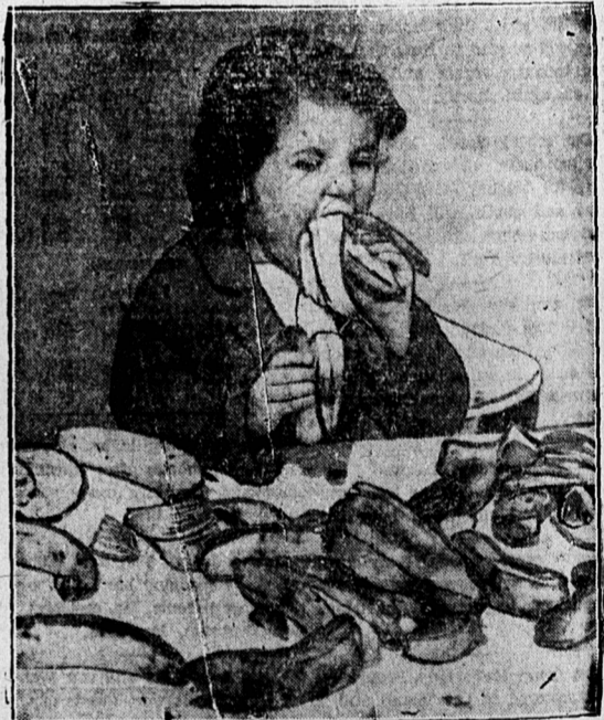
SHIPWRECK A PLEASURE TO HER