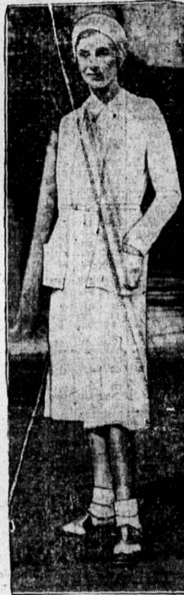
IN RICHMOND SHOW

This picturesque naval scene took place during recent Catham, England, naval week and shows H. M. S. Kent and an old-time ship replica passing N.M. S. York. Much of the color of by-gone days of the sea was introduced into the pageantry and ceremony of the event.