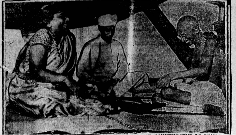
PICTURE STORY OF GANDHI'S TRIP TO LONDON

No, this isn't a circus. This rollicking group of youths and maidens is out to have a good time. The ABOVE picture was taken during the Nuncaton carnival which is celebrated with great enthusiasm every year in England.