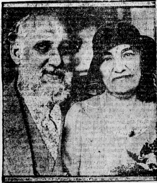
MAKES FIRST APPEARANCE SINCE WILD KIDNAP

Huh! Huh! And for weddings too. These two girls are dressed in the very latest as bridesmaids. Note the trousered tunic and a slight air of the mid-Victorian. Very slight.