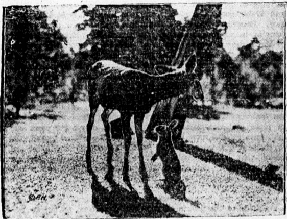
DEER AND RABBIT BECOME PALS