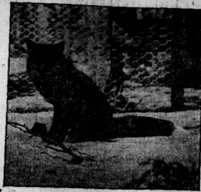
SIR WILFRED, one of the best known and most highly prized foxes in the world. This fox is owned by the Silver Fox Ranching Co., Alberton

There is no investment offering on the market with anything like the same comparative earnings as the fox industry, that has been so little affected. Considering this fact the war should be more of a help than a hindrance to the business, because it will establish for all time to come the fact that the fur industry is permanent and profitable.