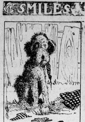
"You've heard about a dog's pants, of course? Well, I'm well supplied now, I've just chewed up three pairs."

INTERNATIONAL LINE Fare from St. John 310, from Eastport or Lubec, Me., 59. Every Wednesday steamer leaves St. John 9:00 A.M. Atlantic Time, Eastport 1:30 P.M., Lubec 2:30 P.M. Eastern Time, arriving Boston Thursday 10:00 A.M. Daylight Time.