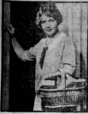
Housework often causes over-strain