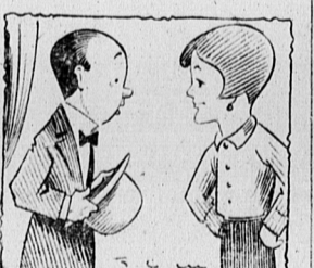
WANTED THEM TAKEN OUTSIDE "Goof (seeing lady of hour angry): I guess you want me to take my gum shoes outside?"