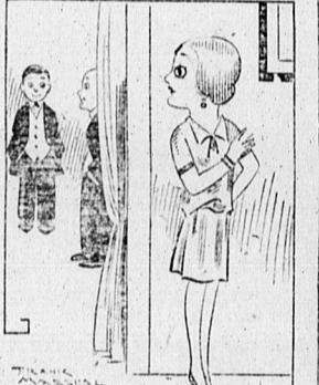
REMOVED THE SPOTS "Does your wife remove spots from your trousers?"