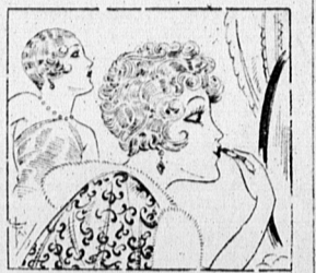
PETTY THIEF "He's stolen hugs and kisses from me."