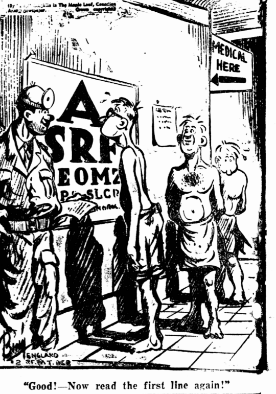
"Good! Now read the first line again!"

DETROIT, Oct. 1 (AP) — Rain-drenched Detroit put its faith in the weather man today and looked forward to seeing the World Series open on schedule Wednesday.