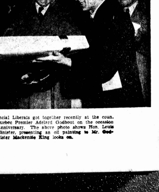
Federal and Provincial Liberals got together recently at the country home of former Quebec Premier Adolphe Goebout on the occasion of his 53rd birthday anniversary. The above photo shows Hon. Louis St. Laurent, Justice Minister, presenting an oil painting to Mr. Goebout, while Prime Minister Mackenzie King looks on.