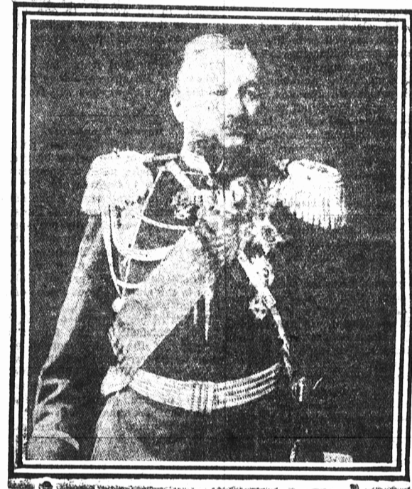
M. VON WAHL, WHO SUCCEEDS M. DE PLEHWE.