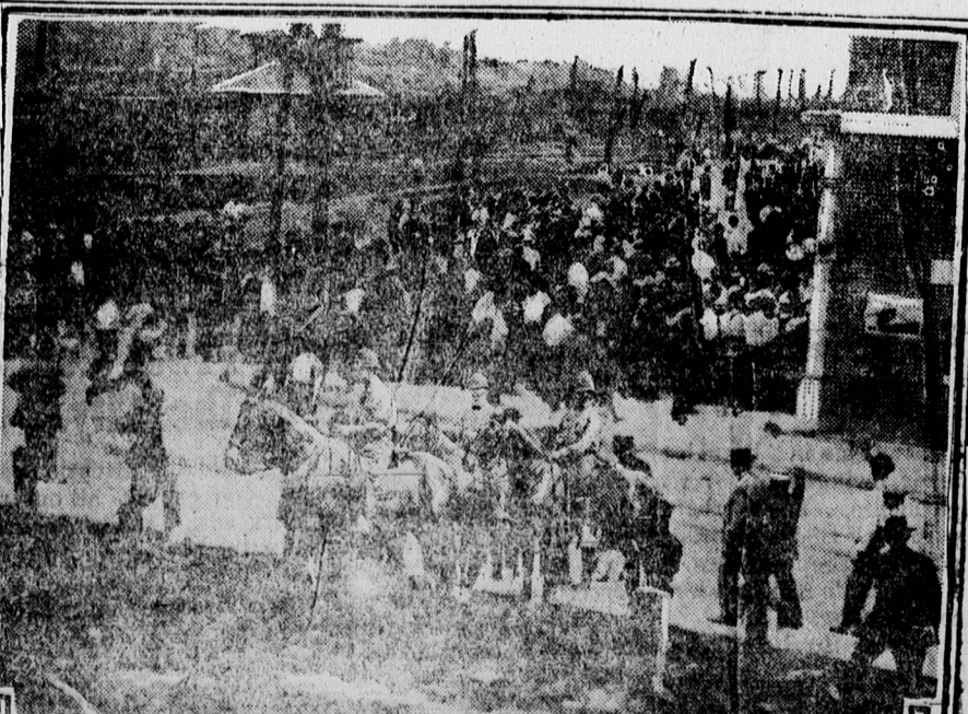
FROM A PHOTOGRAPH MADE DURING A RIOT IN THE PITTSBURGH COAL STRIKE IN WHICH A NUMBER OF STRIKERS WERE HURT BY PLAYING STONES. IN THE FOREGROUND, IS A GROUP OF MOUNTED STATE GUARDS.