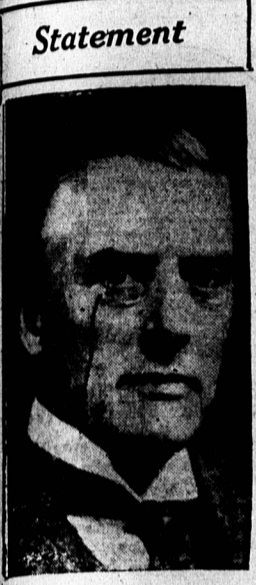
ISSUED BY CHAMBERLAIN

Sir Austen Chamberlain first lord of the admiralty, which had issued statement regarding investigation of the reported unrest in under ranks of navy as result of wage out.