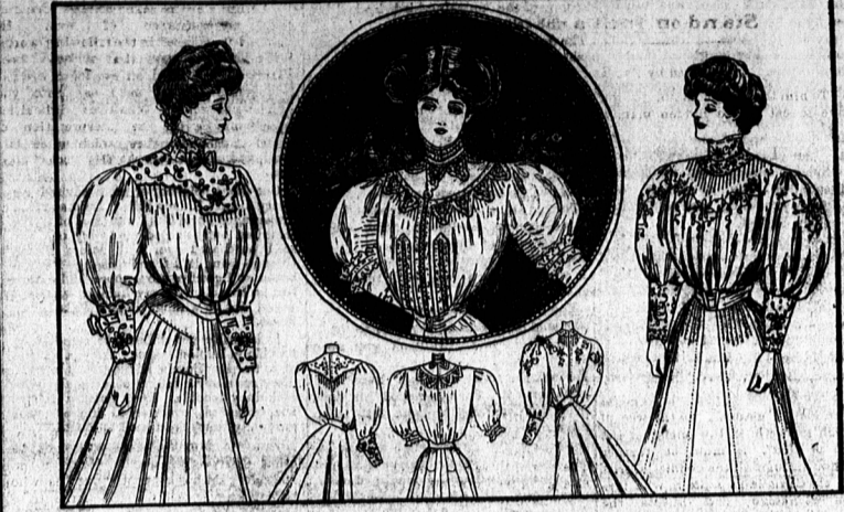
Small velvet or silk bows placed down the center of a lace yoke, with small rhinestone or cut steel buttons in the center of each.

No matter what the season, the separate blouse is always in favor, and for certain occasions it really is indispensable. These lingerie blouses may be as simple or as elaborate as one pleases, but the outline is invariably the same, and always on the plainest of shirt waist models. Yoke effects are very much liked, and the best styles show a great deal of fullness in the back as well as in front. I have tried to make the design for the embroidery as distinct as possible, so that it could be easily copied in the correct size on paper, and then traced on the material. The waist from which the design was sketched was of white French nainsook, the kind that comes slightly stiffened, although of transparent texture. French mullin is also a very popular material for the washable blouse. In the models shown among the drawings, I have shown the styles requiring hand work and embroidery, in preference to the simpler machine-made bodices, which are usually simply tucked or else trimmed with embroidery or lace bands. For instance, in the first figure in the larger drawing, the original garment was in pale blue surah, with the open work design on the yoke and sleeve cuffs done in embroidery silk to match. The edging to match knife plaited in a little