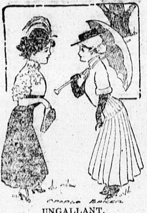
UNGALLANT. 1912—"What is a suffragette?" 1913—"A being who has ceased to be a lady and is no gentleman."