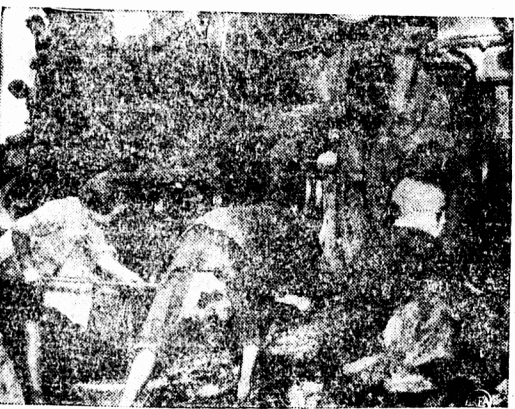
SCOOP — Children rush to scoop out hot coals from underneath the locomotive as the train stops for a few minutes. Embers will be used for heating purposes by the chilled, hungry refugees, who huddle together for protection against chill November winds.