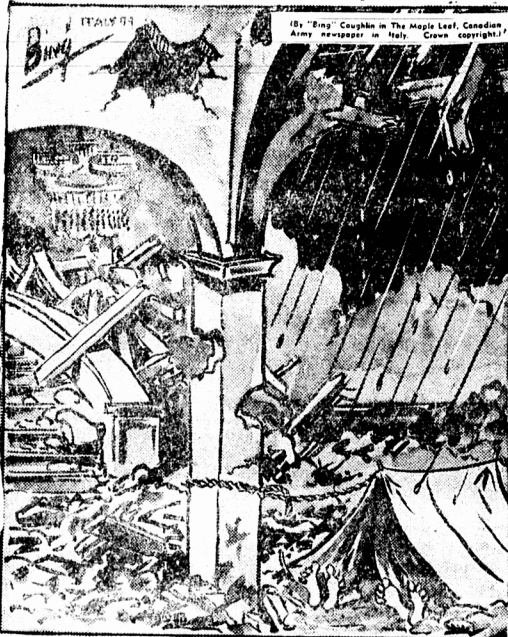
'Well it's the best hotel in town, ain't it?'