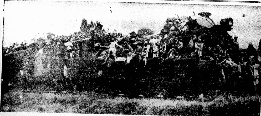
EVACUATION EXPRESS — As Jap troops converged on Luchow from the north, south and east, the long-suffering Chinese civilian population prepared to flee. For weary thousands, no transportation could be provided. A lucky few, shown in these remarkable photographs taken by NEA-Acme cameraman Frank Cancellare for the War Picture Pool, crammed every inch of space on a freight train loaded with human cargo. They clung to their babies, to a few scraps of food, to such pathetic luxuries as the parcel shading the youngster huddled close to the smokesack. From locomotive to caboose, wherever their fingers could hang on, refugees clung to the train.