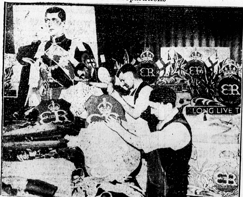
Though the coronation ceremony do not take place in London until next May. Many factories are already busy making shields, flags, bunting, posters and other decorations. The interior of one of the factories is shown here.