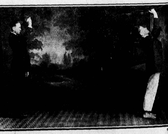
BLOYCE BOWAN Shooting disc held in man's hand, standing with back to object (by aid of mirror.) A big attraction at New Annan Races, August 17th.