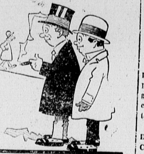
'Why did Gilla give his wife a clock that strikes the quarter?'

SWORD AND GREENSWARD A football player casts into the shade. The bravest soldier and his bright steel sword: For Mars will fail to fascinate a sword. Who loves the gridiron game on grilled greensward.