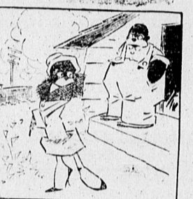
'Yes, daddy, dat tall pullman cab poutah dat calls on me am known to his friends as 'Sugar.'

SWORD AND GREENSWARD A football player casts into the shade. The bravest soldier and his bright steel sword: For Mars will fail to fascinate a sword. Who loves the gridiron game on grilled greensward.