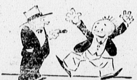
'Why do you jump up and down so hilariously? You know nothing of the game.'