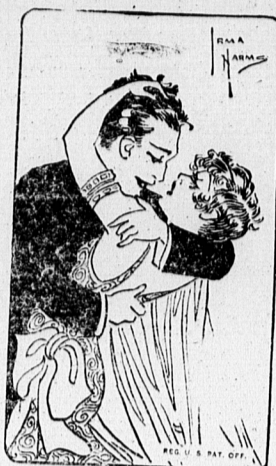
'A distant relative kin be closer to a girl than her nearest kin.'