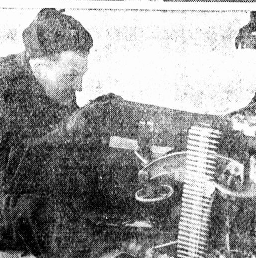
Little Norway's telephone operator escaped from Oslo to Canada via Sweden, Siberia and Japan. Machine gun practice, in lower photo, sharpens the aim of flyers.