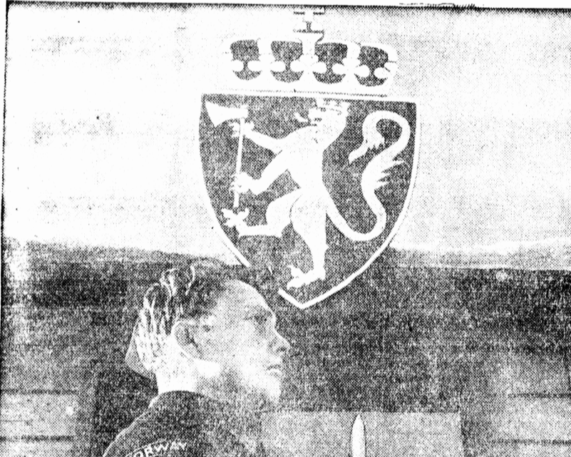
Armed with rifles and bayonets Norwegians guard the buildings throughout their camp. In the above photo the Royal Norwegian coat of arms has been placed above the doorway of a hut. Barely discernible beneath it is a good luck horse shoe.