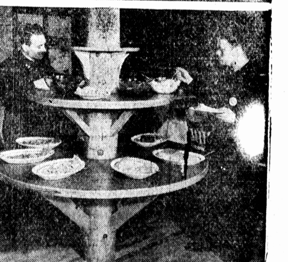
Quarters are built in traditional Norwegian style. In upper photo, officers entertain friends in the mess. At bottom they are shown eating from the "smorgaasbord".