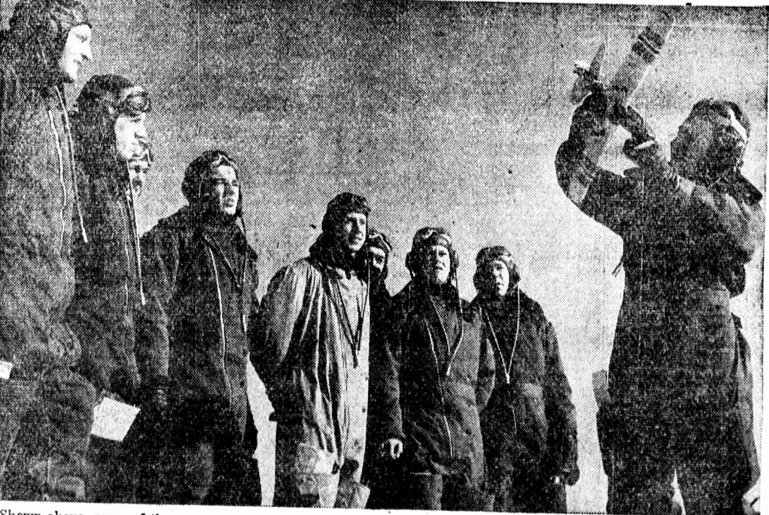
Shown above, some of the men training to fight on for Norway. Names must remain secret for duration, because families are in the Germans' power. Bottom picture shows student group receiving ground instruction. Latest in National Film Board's "Canada Carries On" series is "Fighting Norway", tribute to Norway's fine courage.