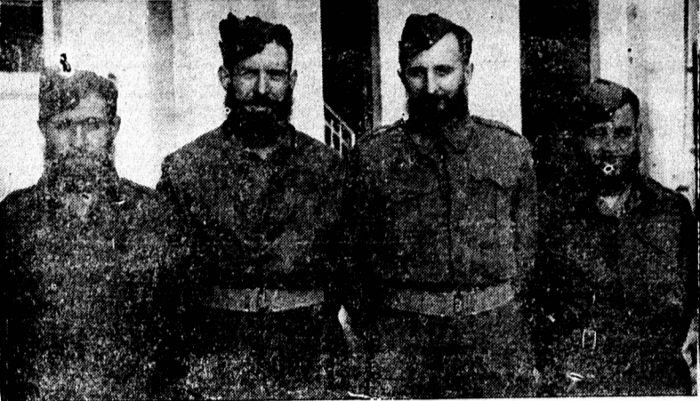
Like the bearded prophets of old, these four Canadians on the battle front of Italy vie with each other the growing of facial adornment. Soldiers in Blanchette, of Windsor, Ont..