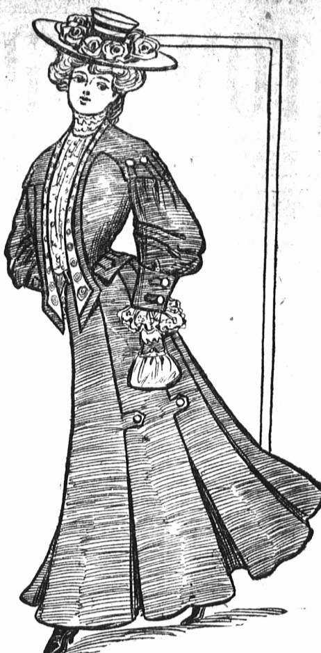
Here is a modish tailored two-piece street suit for young lady. It is made of dark blue serge and trimmed simply with narrow black braid and smoked pearl buttons. The jacket revers are turned back and faced with taffeta silk stitched with blue in wheel designs.

It will be remembered that in the appeal of New Brunswick and P. E. Island to the Privy Council on the representation question judgment was reserved, although enough was known for all to understand that the decision would be against the Province. A cable despatch announces that the two appeals have been dismissed without costs.