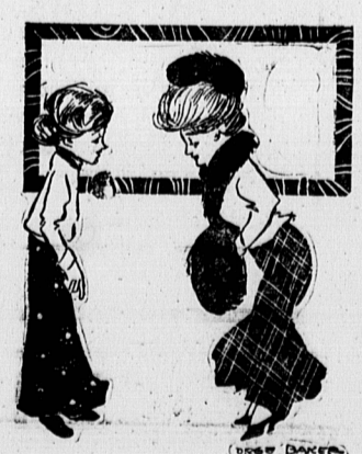
"Did she refuse him?" "Practically, she said she would not marry him till he arrived at years of discretion." - Brooklyn Life.

WASHINGTON, Nov. 2.-Commander Peary was yesterday endorsed as the National Geographical Society. Everything indicates that Peary's personal statement to the Society convinced its members that he set his foot on the top of the World. The explorer has been invited to deliver his first lecture before society on Nov. 30th.