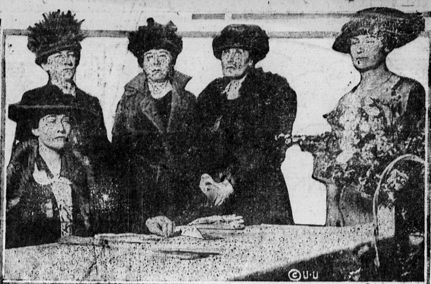
PROMINENT WORKERS FOR THE AMERICAN WOMEN'S LEAGION WHO WERE ELECTED OFFICERS AT THE FIRST NATIONAL CONVENTION

If you suffer with Rheumatism, Sciatica, Lumbago, Stiff or Swollen Joints, Lameness, Sprains or Bruises, rub with "ABSORBINE JR."—the great family liniment and home treatment. $1.25 a bottle—at most druggists or sent postpaid by W. F. YOUNG, INC., Lyman Building, Montreal.