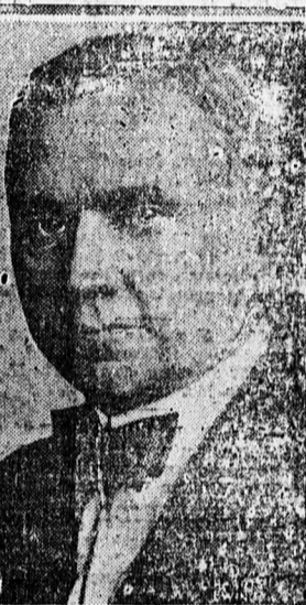
Representative Henry D. Flood

This photograph of Representative Henry D. Flood, of Virginia, was taken in Washington since his election as chairman of the Democratic Congressional Campaign Committee. He has represented the Tenth District, in which is located Staunton, President Wilson's birthplace, for twenty years without a break. During the war Representative Flood was chairman of the House Committee on Foreign Affairs. He is regarded as a likely possibility for the nomination for governor of Virginia.