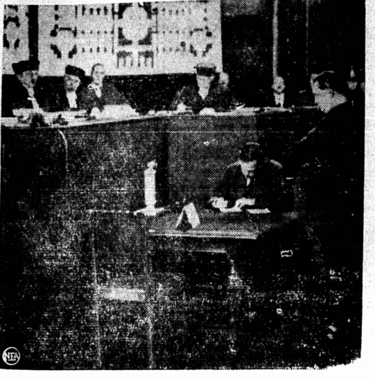
Goering, shown as he testified at Reichstag fire trial, actually believed Communists were guilty, his wife says. He recently admitted he no longer believes so.

HERMANN HORRIFIED In response to a series of questions Frau Goering told me that her husband still believes that Communists set the Reichstag fire that gave the Nazis their real boost into power (he, himself, has said recently that he no longer believes this); and that he never approved of any atrocities. "It's true that Hermann organized the first concentration camps," she admitted, "but he only wanted to detain dangerous persons. I have overheard how outraged he was when he learned that people were beaten there, and that he ordered punishment of those who did it. Later Himmler took charge and Hermann knew no more what went on in the camps than did any other Germans. He was horrified when, during the last years, he learned some details. "Yes, Hermann did organize