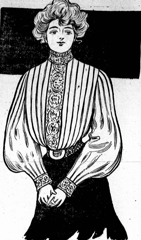
A neat shirtwaist for fall, made of white silk and wool mixed canvas, trimmed with broad, front box pleat and cuffs of Oriental embroidery in tints of green, red and gold on body ground of white.

The siege will live in history as a memorable one. Nor can it be said, since war is what it is, that all the frightful carnage has been in vain, or that Stoessel ought even now to surrender if he can hold out longer. Elliott defended Gibraltar for three years. The men defending Port Arthur are giving their endurance and their lives to hold in check an army of