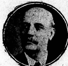
J. FRANKLIN FORT, Governor of New Jersey.