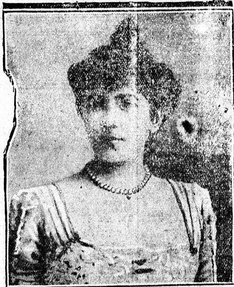
The Countess Russell