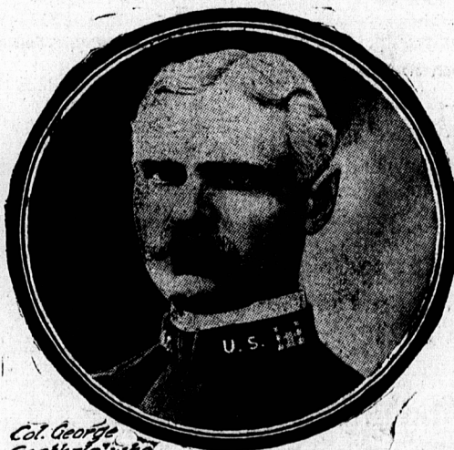
Col. George Goethals, who has made the Dictator at Panama.