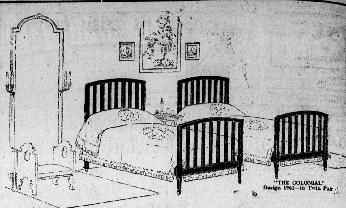
"THE COLONIAL" Design 1961—in Twin Pair