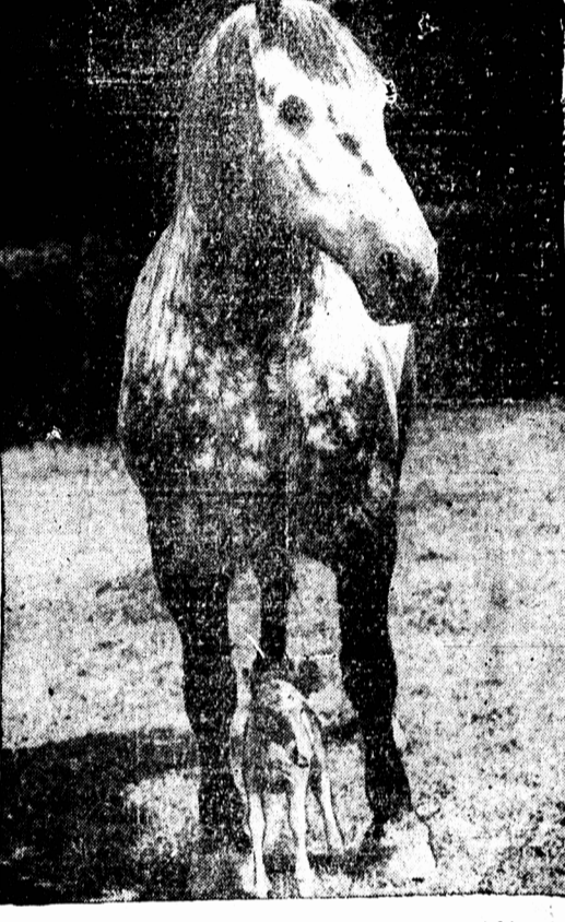
Both real horses are Punch, the giant Percheron weighing over a ton and the little chap between his legs, a 14-day-old Shetland pony. Both live on a farm at London Colney.

A meeting of horsemen will be held at Walker's Barn at 8:30 tonight when positions of horses will be drawn for Covehead races.