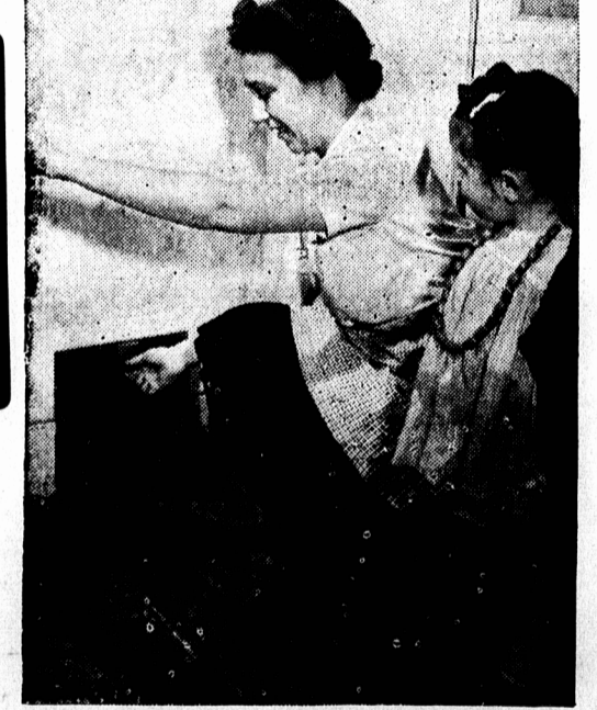
What's Mummy doing now? asks the interested young lady above. Saving coal might be the answer. This mother knows that one simple way to help conserve the winter's supply of coal is to shut off the heat in those rooms which are unused during the day. The Department of Munitions and Supply says that substantial savings will be effected through turning off registers or radiators and closing the windows and doors of all rooms not used during the daytime.