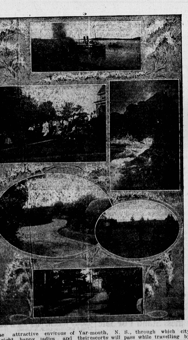
The attractive environs of Yarmouth, N. S., through which city the eight happy ladies and their escorts will pass while travelling by the Dominion Atlantic Railway and steamship lines, on the big free trip.