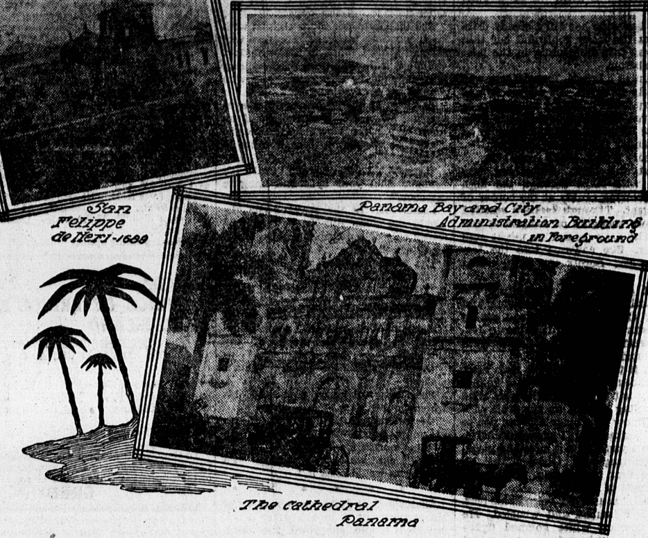
The cathedral Panama