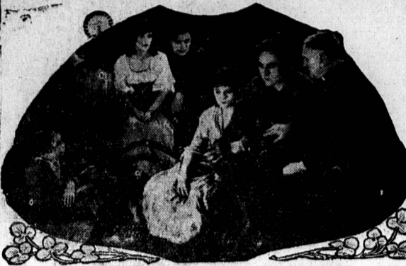
SCENE FROM "MY WILD IRISH ROSE" In this picturesque group around the fireplace in the old priest's cottage, most of the important members of the cast of "My Wild Irish Rose" may be seen.

"MY WILD IRISH ROSE" At the Prince Edward Today and Tuesday