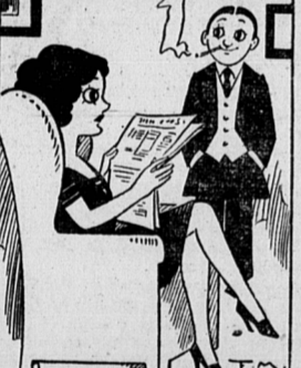
THAT'S OUR BET, TOO Wife (reading): This humorist says the modern mother can hold safety-pins and a cigarette in her mouth at the same time.