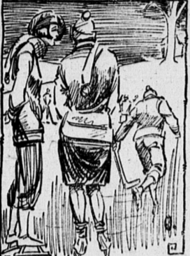
REPUTATION GONE "He used to have the reputation of never starting anything he couldn't finish."