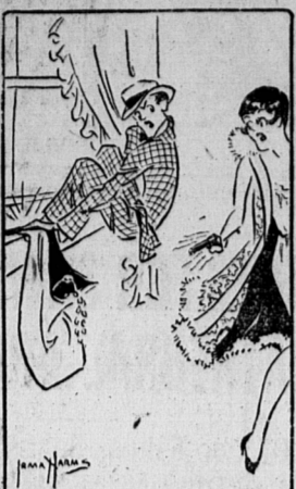
Sometimes it's impossible to straighten things out when you're in wrong.