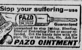
Stop your suffering—use PAZO OINTMENT