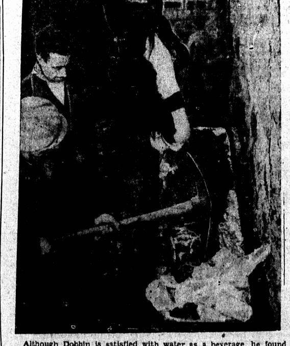
Although Dobbin is satisfied with water as a beverage, he found a little difficulty on this Perthshire (Scotland) farm when the farm hand had to use a pick to break the ice in the water trough.

TOOK ISLAND'S NAME Sardines were named after the island of Sardinia.