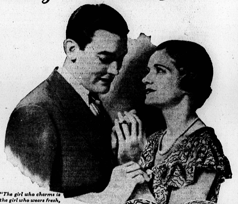
"The girl who charms is the girl who wears fresh, lovely colours."

No—frequent washing doesn't ruin colours. It's using ordinary soap—even ordinary "good" soap—that fades colours and even if it does not always