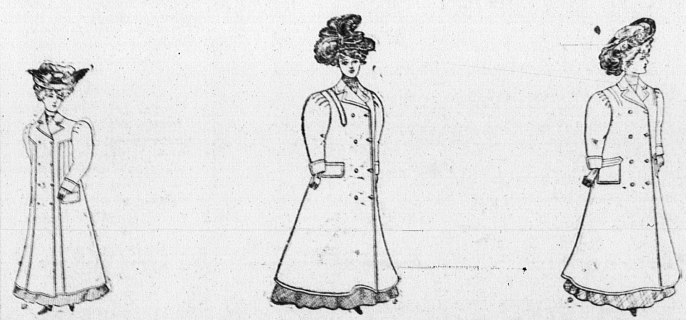
13.50, 16.50, 18.50, 20.50, 22.00.