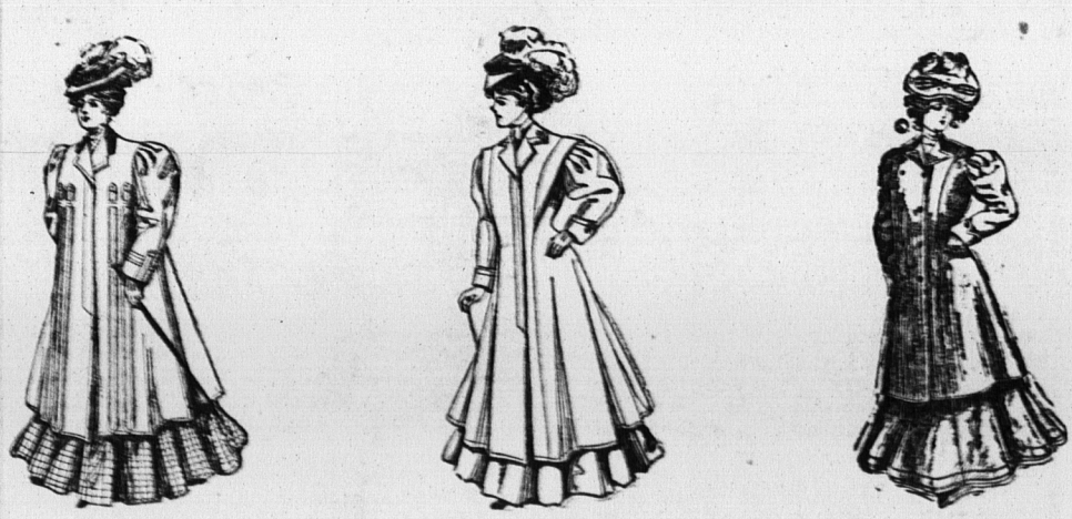
Hundreds of New Coats in all Kinds Extra Large Coats up to size 44. One Hundred Misses and Little Girls Coats just made like mothers also large stock of smart little Reefers $2.00, $3.00 and $4.00.