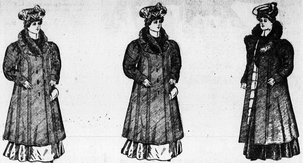
German Jackers in Blood cloth in Navy, Wine, Taus, Drab Browns and G

We invite Comparison. 15 new ones, opening this morning. They are first choice and only choice for Ch' Town from the best makers in the Dominion.